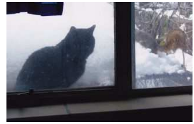
Timmie before his rescue.