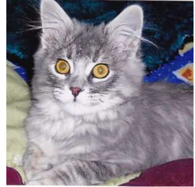
Briana, the most beautiful kitten in all of Colorado.

Briana immediately went into a foster home for about a week because I had no room for her. We were in the middle of our annual fundraiser and every room except Timmie's was full of new merchandise for sale. However, I woke up one Sunday morning at 5 a.m., packed up all of the tables in the back room, called the foster home, and had her returned to the shelter that afternoon.