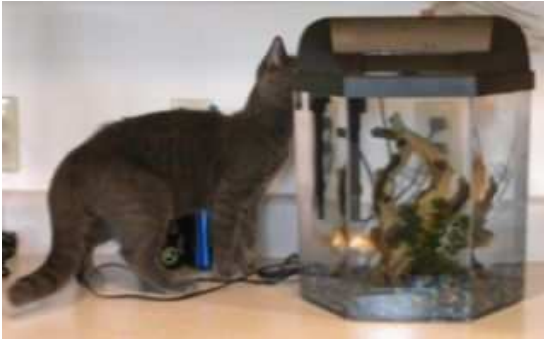
Ashe busy being a growing cat.