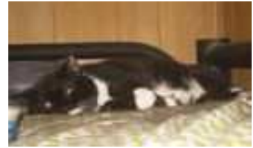
Mittens

"I say all this in the past tense because Mittens left for heaven on January 3, 2011 at exactly 9:58 a.m. I was there for him in the end, whether he knew or not. My top bunk is very empty, and a huge part of my heart left with him. Even though I only had him 16 very short months, losing him was no less painful then losing cats who were family for 10 years, 17 years, 19 years, or 21 years.