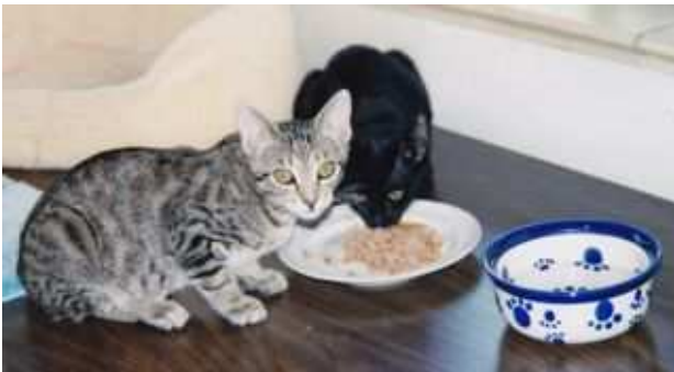
Tigger and Turbo at the shelter soon after arrival from Waveland, Mississippi.