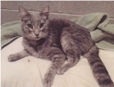
"Basement Kitty"