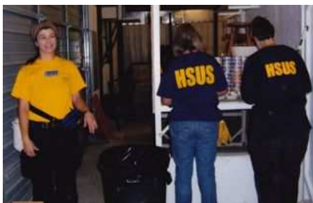
Feeding over 150 cats is a team effort. You can see the stacks of canned cat food in the background.